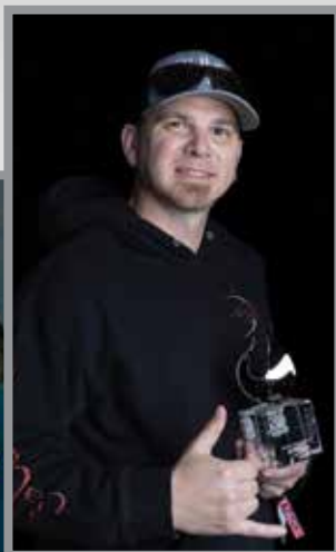
Third Place Habitat Glass @habitat_glass Reef Guardian