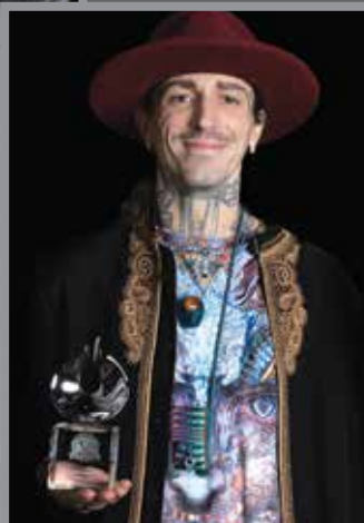
Second Place Whatever is Clever Art @whateveriscleverart Oh Boy