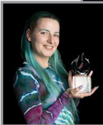
People's Choice KT Scissorbaby @ktsissorbaby Glass Dress