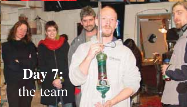
Day 7: the team